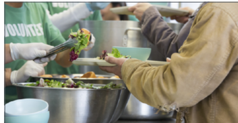
Monday Feeding Program

Sunday worship attendance: 8:00, 10:30 Jan. 1: 35 Jan. 8: 19, 59 (total 78) Jan. 15: 23, 63 (total 86) Jan. 22: 17, 70 (total 87) Jan. 29: 24, 71 (total 95) Average Jan. 2017: —76 Average Jan. 2016: —75