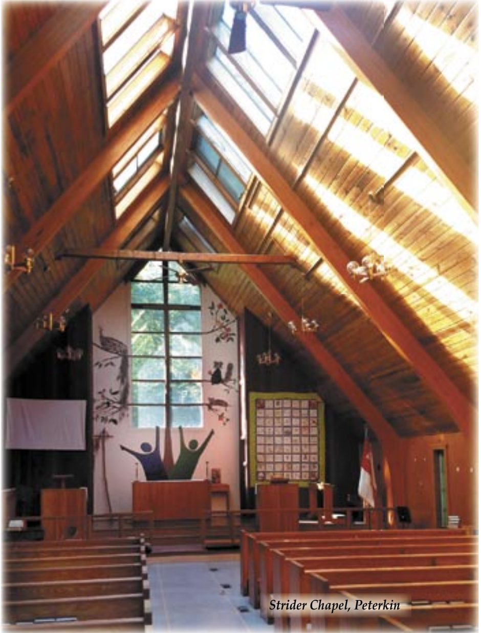
Strider Chapel, Peterkin