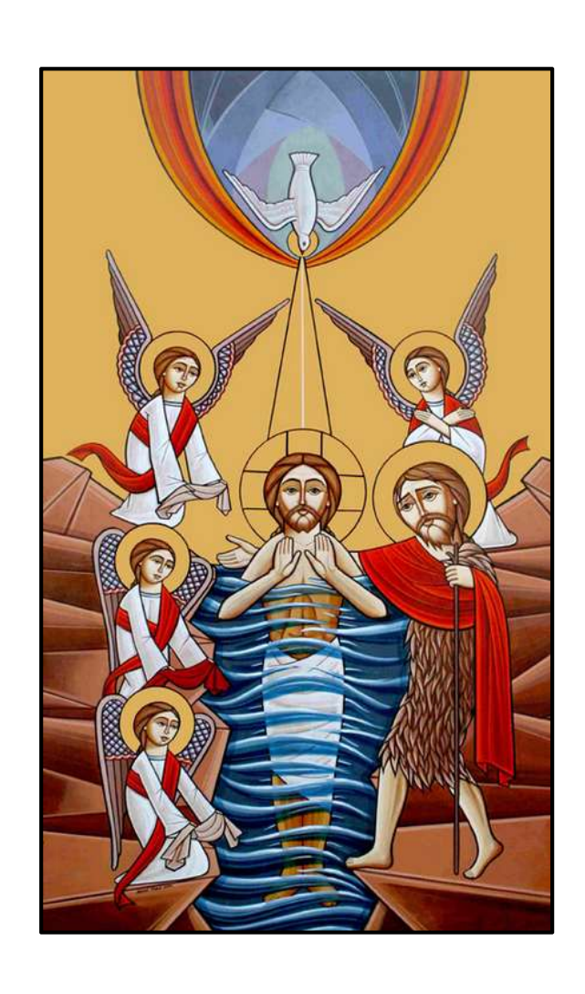
Trinity Episcopal Church

The First Sunday after the Epiphany: The Baptism of our Lord Jesus Christ Holy Eucharist 12 January 2025 at 10:30 AM